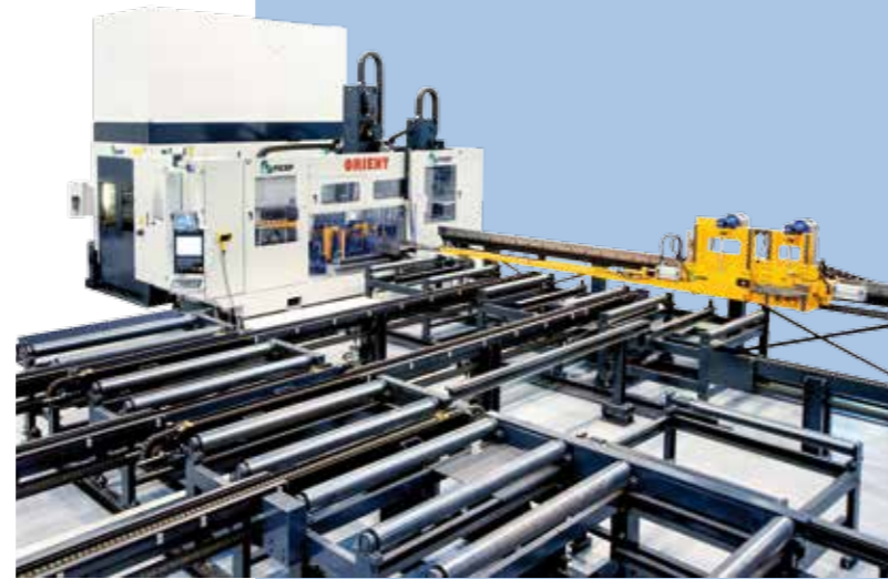
Orient drilling line combined with a robotic coper