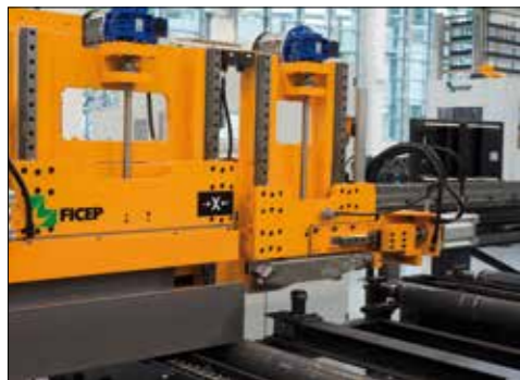
Double gripper system for reduced overall dimensions