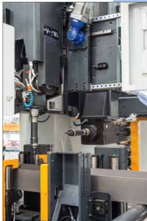
Second drill head with automatic tool changer