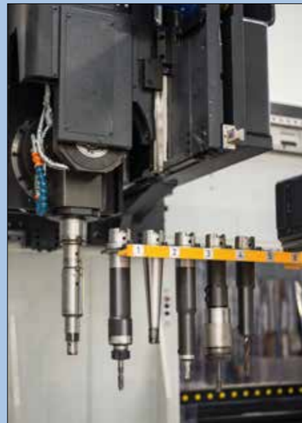
6 position tool changer