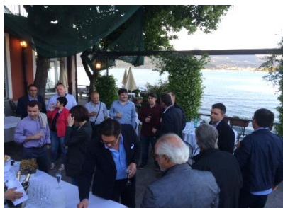
Dinner on Lago Maggiore