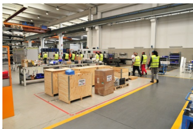
Ficep Assembly Area