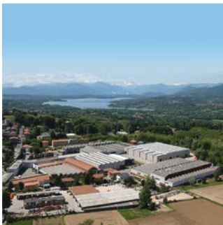
Ficep's Main Facility